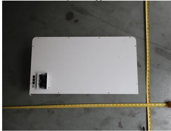
电池正面外观 Battery front appearance